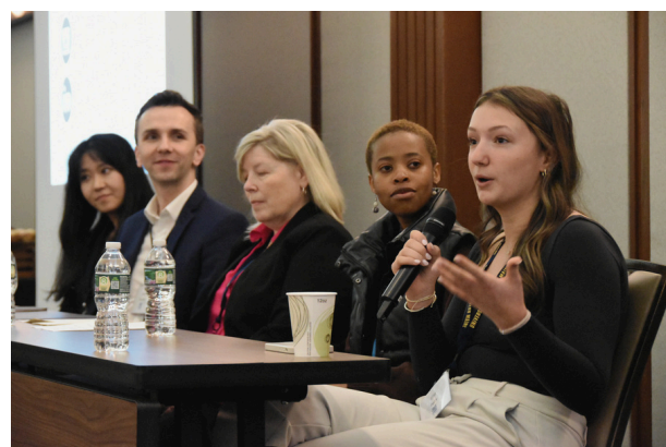
NENA Spring Conference 2024: Students & Faculty at The Regency Hotel in Portland